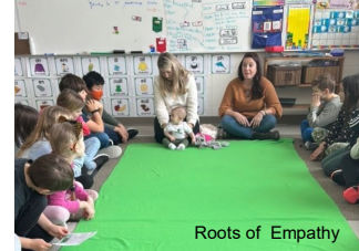
Roots of Empathy