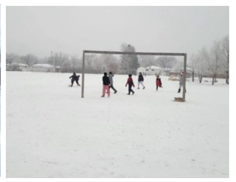
Winter fun times @ school