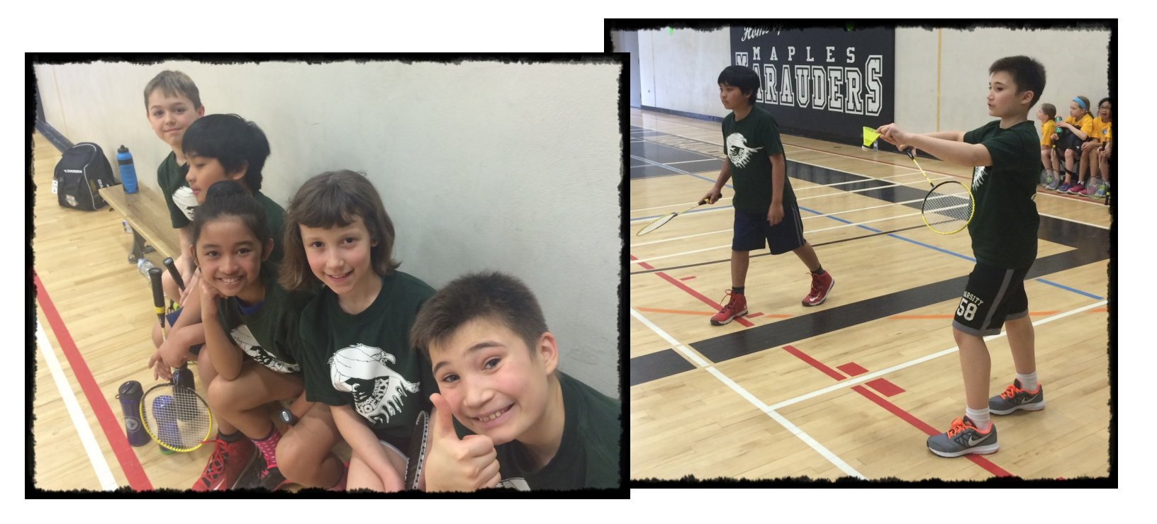
Grade 4/5 Divisional Badminton Tournament at Maples Collegiate