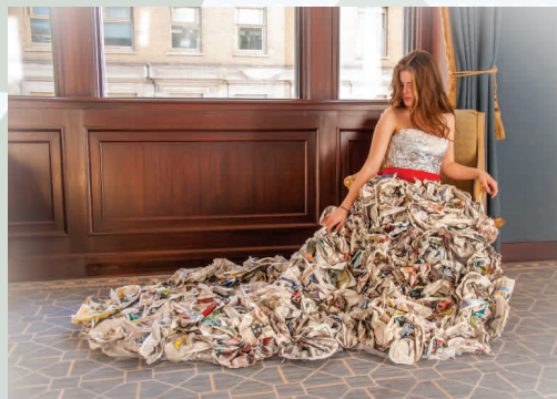
A dress made from newspapers

Manitoba Eco-Awareness Day/ Recycled Material Fashion Fest Saturday, January 23, 2016 at St. Vital Centre