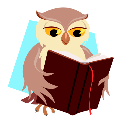
Children learn and develop best through play.

If you do not have a pre-school child, please pass this on to someone who does.