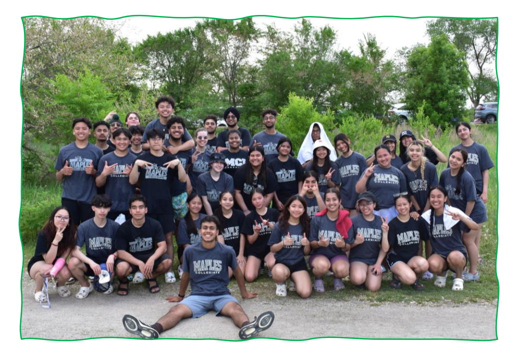
Dragon Boat Group

The goal of this course is for students to foster an appreciation of the various religious traditions practiced by peoples throughout the world. It is not meant to confront or change a student's own beliefs, but rather to provide students with an objective appreciation for the religions studied. This will be achieved through a comparative study of the beliefs and practices of major world religions and their contributions to each other. Though some time will be dedicated to the study of traditions that are not as widespread, we will focus primarily on Sikhism, Indigenous spirituality, Hinduism, Buddhism, Judaism, Christianity and Islam. A significant amount of time will be dedicated to assessing the impact religion has had on world issues throughout history, with a special focus on current global events.