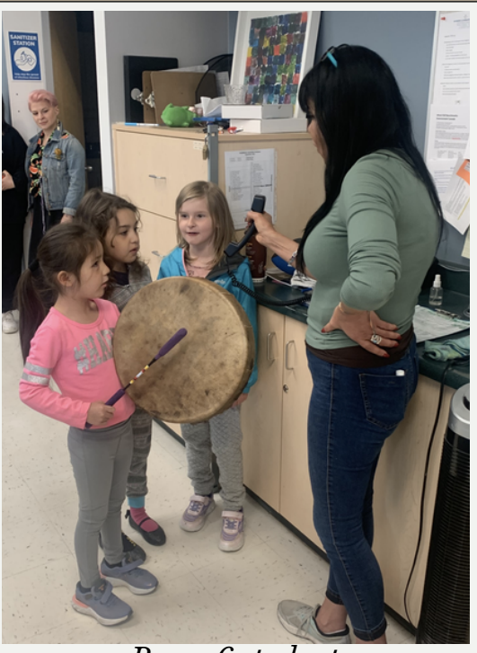
Room 6 students Singing The Bear Song