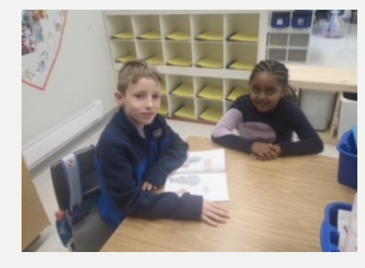
Room 10 & 23 Reading Buddies

Our students made kindness buttons to share with each other on International Day of Pink. We wore Orange Shirts to acknowledge and honor the survivors and those that didn't make it home from residential schools. On Red Dress Day the students hung red dresses on their classroom doors and painted red stones that they placed throughout our community to bring awareness to missing and murdered Indigenous women and girls. Our students collected money for cancer research during our Terry Fox walk, our staff raised money for the United Way with soup fundraiser. Many older classes buddy up with younger to form learning partnerships.