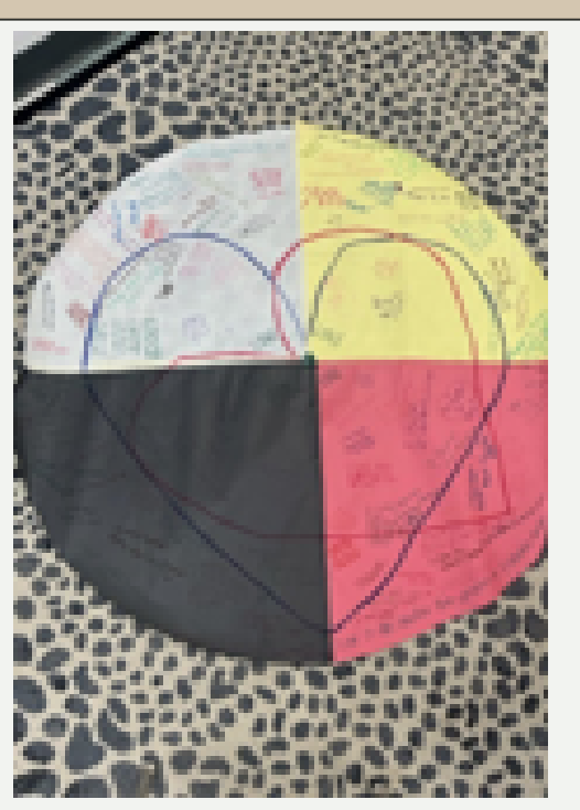
Created by Rooms 18&19

Many of our classrooms started their year by making classroom treaties or promises that help set their intentions for the school year as well has learning about the medicine wheel. Sharing circles are also used to honour the stories that children bring to school.