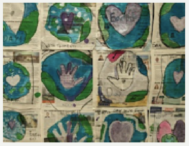
Room 16 Earth Day Art

On Earth Day classes talked about the ways in which we can care for the earth. One of those ways is composting. Student leaders from Room 18 gather compost bins from all areas of the school each week. The compost is weighed and recorded each week. Students are learning how to sort their waste into garbage, recycling and compost.