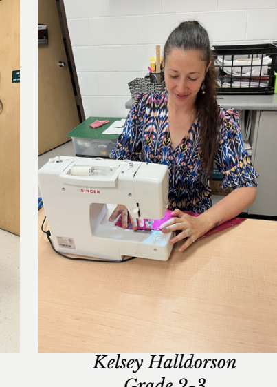
Grade 2-3 Ojibwe Bilingual