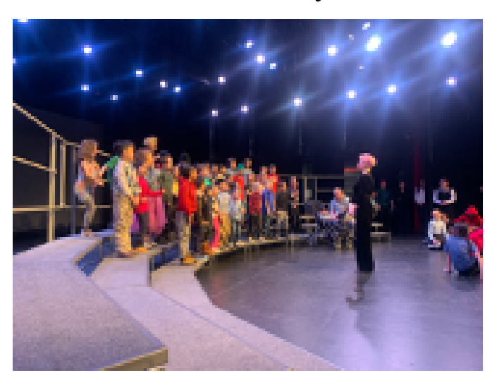
Spring Concert SOPAC