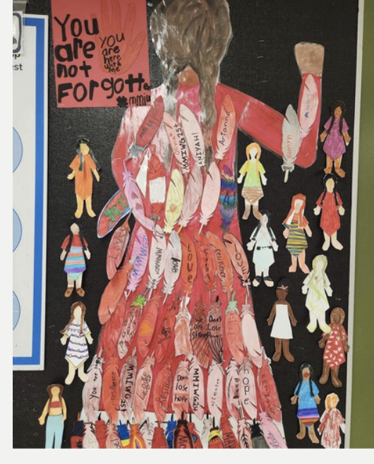
Red Dress Day

Our students made kindness buttons to share with each other on International Day of Pink. We wore Orange Shirts to acknowledge and honor the survivors and those that didn't make it home from residential schools. On Red Dress Day the students hung red dresses on their classroom doors and painted red stones that they placed throughout our community to bring awareness to missing and murdered Indigenous women and girls. Our students collected money for cancer research during our Terry Fox walk, our staff raised money for the United Way with soup fundraiser. Many older classes buddy up with younger to form learning partnerships.