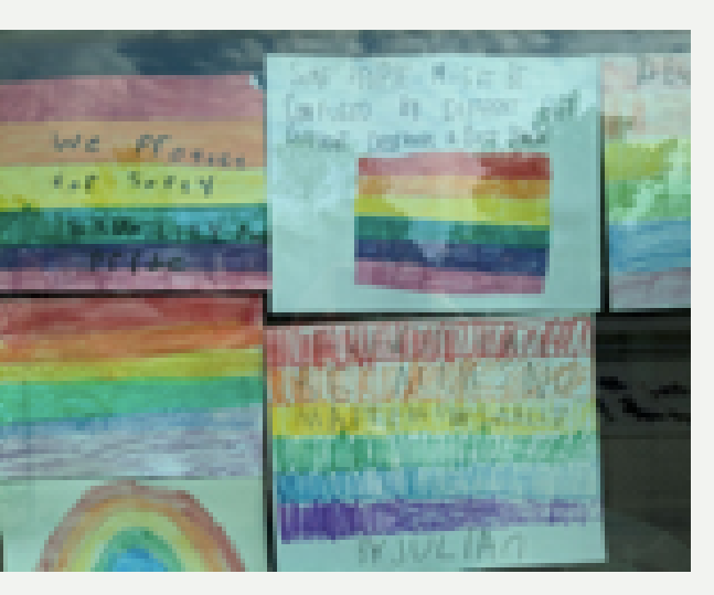
Posters made by Room 3

Sadly, in May our Riverbend's Pride flag as well many books about diversity and indigenous themes were stolen. This event sparked many emotions for our staff and students. Our message to students will always be that they have the right to be who they are without discrimination. Many conversations were had some bringing tears and frustration. Our school community came together creating messages of love and support and our school walls were covered with kind words, rainbows and our Pride flag hung proudly in a front school window.