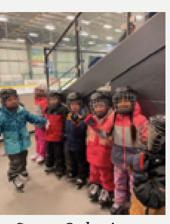
Seven Oaks Arena

Our students have had many opportunities to go on a variety of field trips including the Nature Playground, , The Zoo, MTYP, bowling, Sage picking at Bird's Hill, as well as attending sessions of "Learn to Skate" and "Learn to Swim". Room 16 went to Festival Du Voyageur. They learned about the fur trade and learned some new French songs. They got to touch different kinds of furs and learned about many Indigenous inventions such as the canoe and wicker baskets. Rooms 14, 18 & 19 attended STEAM Fest at the end of April. Students explored activities and displays with a focus on: science, technology, engineering, arts and math. Students also had a blast doing interactive programs on these topics. It was a huge learning opportunity that many students are looking forward to next year!