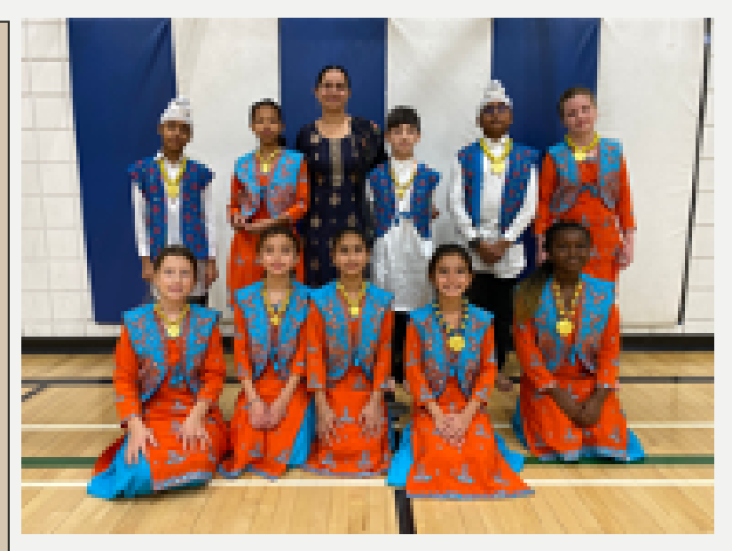
Riverbend Bhangra Group