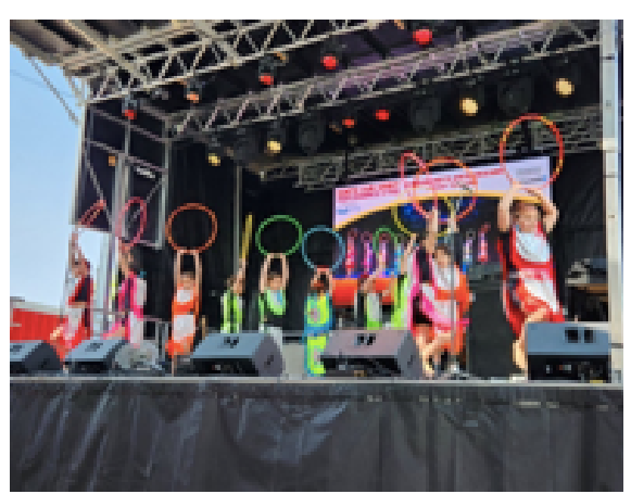
Manito Ahbee Festival