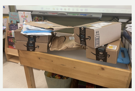
Letters of support and book donations