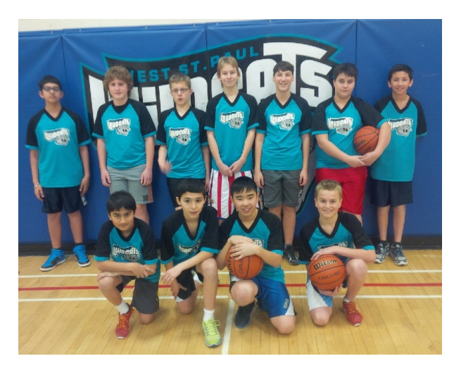
Gr.7/8 Boys Basketball