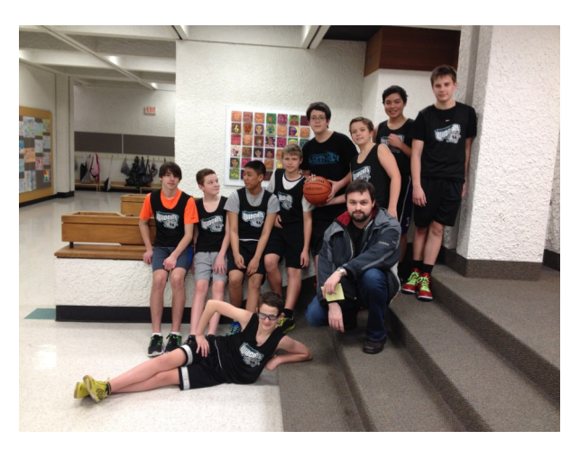
Divisional Boys Basketball