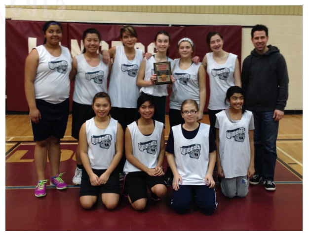
Divisional Girls Basketball

We are now into Badminton with high numbers of participation at all grade levels.