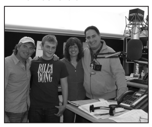
A Met student hard at work at internship