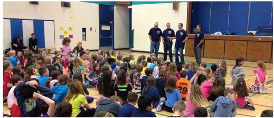
Four members of the Winnipeg Goldeyes Baseball Club speak to students on Thursday, May 9th.