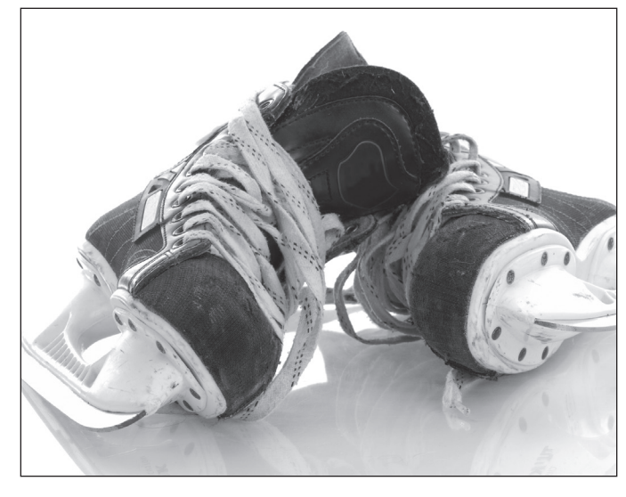
The scholarship winners of today may become the Platinum Jets' donors and members tomorrow.

The Platinum Jets have funded scholarships for more than a decade now, and have even gone so far as to establish a perpetual fund with the Winnipeg Foundation to help ensure the scholarships continue to be available to North End students in the decades to come. Of course, this