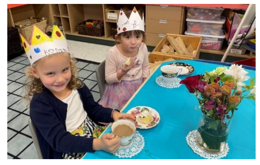
Cora Campbell Kindergarten