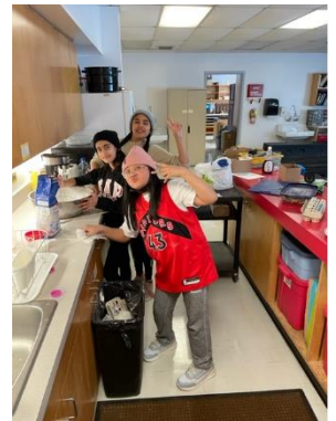
Crepe-making for Festival