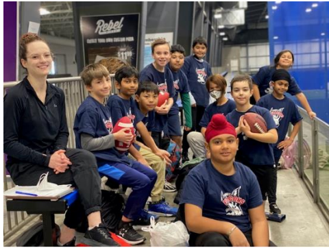
Football club, jigging and our grade 3/4 Festival Concert

Free will is cultivated by responsibility so that the child can say, “I have the power to make decisions.”